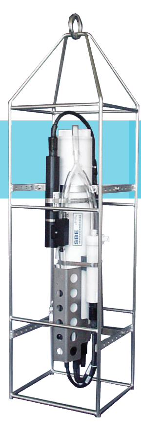
SBE 43 voltage output sensor integrated with SBE 19plus V2 CTD

Five-year limited warranty (during warranty period, one sensor re-charge [electrolyte refill, membrane replacement, recalibration] performed free of charge).